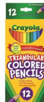
3 boxes of 12 regular pencils #2